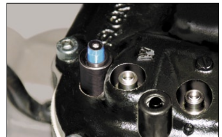
Minimum air pressure indicator button appears "blue" to confirm that minimum air pressure is available for tool operation.

For use on 1-1/4" (32 mm) High-Strength Tenax® polyester strapping Part Number: 428225