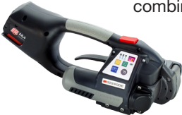
BXT2-16/19 battery powered combination tool